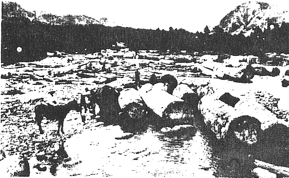
Kauri logs at Tairua around the turn of the century.

that the Governor, on the advice of his Ministers, might 'establish at pleasure settlements upon any land belonging to natives within any district within which such land was situated that was in the possession of a tribe, section or considerable number of natives who the governor was satisfied had engaged in rebellion.' This law simply provided that all communal owners would be punished for the actions of disaffected individuals. The intention was to confiscate the land of all Maori people in arms, and the logical process was to engage as many as possible in armed resistance. As the army advanced, burning crops and homes, it created 'rebels'. During the Waikato war, two offers of surrender were refused by Cameron, instructed by the Government. The provocative invasions continued to Tauranga, Taranaki and Maniapoto hinterlands.