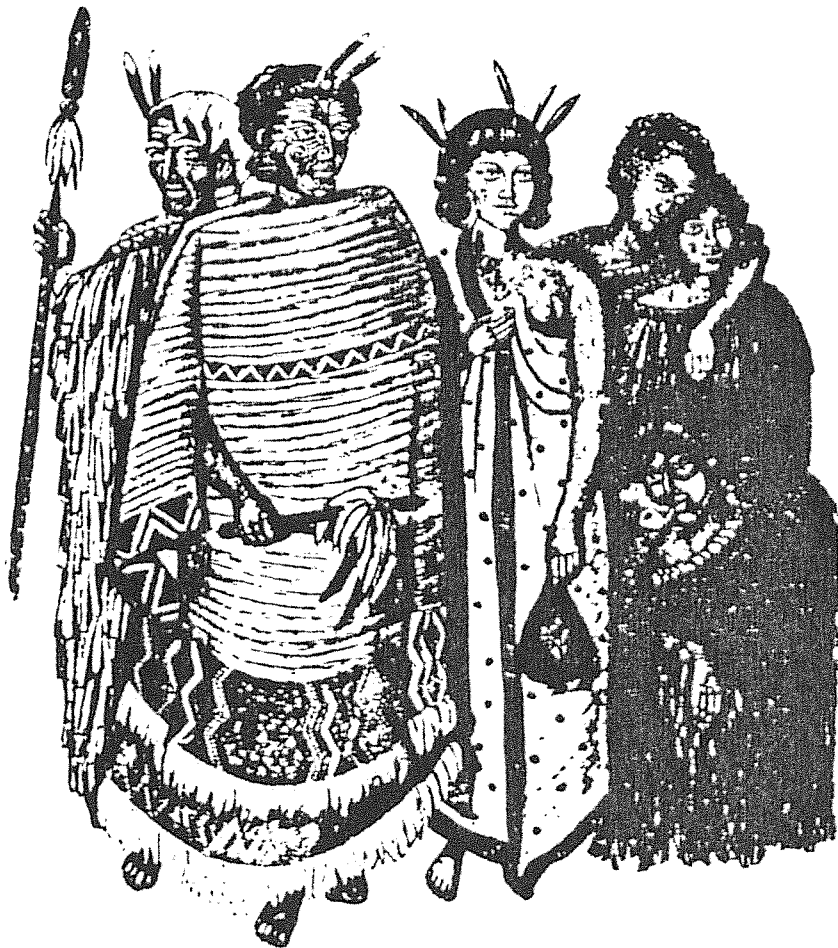
Pakeha perception of Maori people.

The first mission schools taught entirely in the Maori language, and literacy was soon high among the Maori population. Then English was introduced as a foreign language. The Native Schools Act of 1858 made government grants available to schools teaching the English language and an English curriculum. Another act in 1867 carried the attack even further: it established English as the sole medium of instruction.